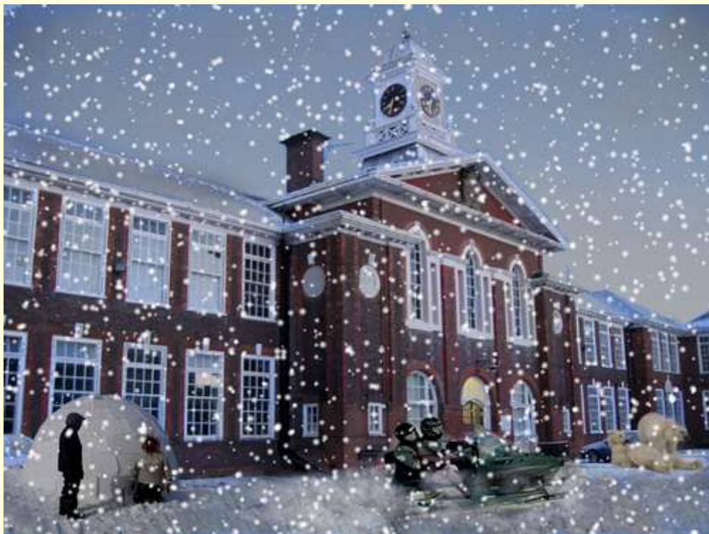
The Quad: Nothing in the school rules forbidding snowmobiles

Ed: Do these pictures of the School buildings bring back memories and fill you with a touch of nostalgia?