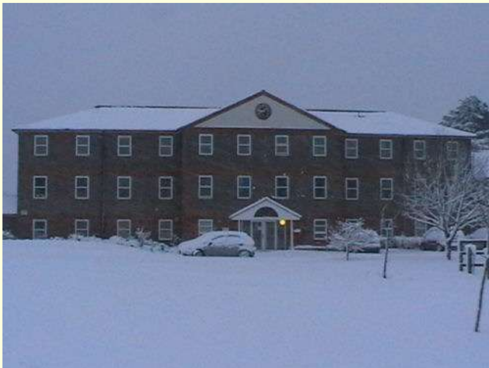
The Boarding House