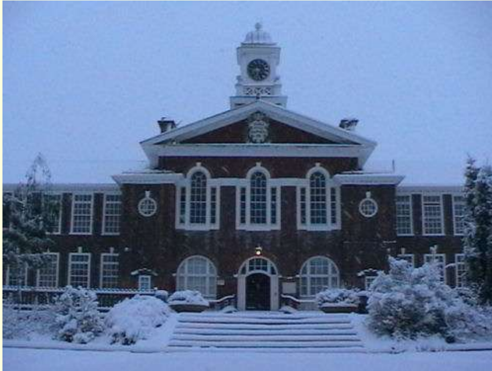
The Main Building