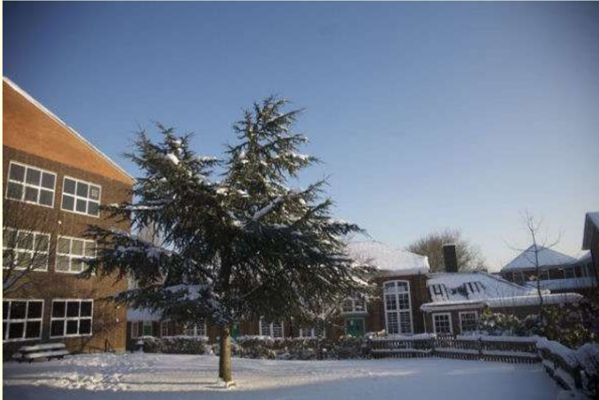
Picnic Area next to the Science Block - picnic anyone?