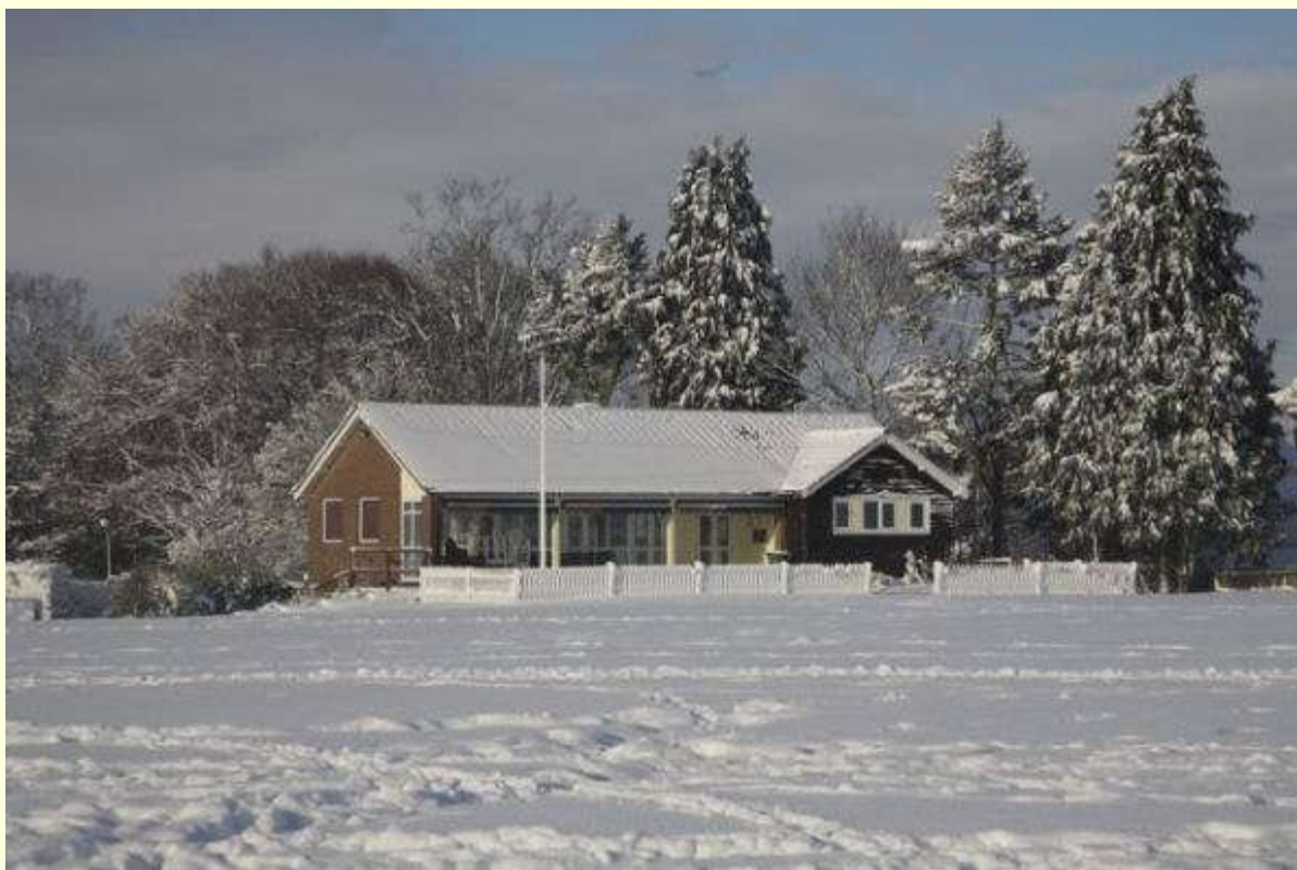
View across to the Cricket Pavilion. Cricket anyone?